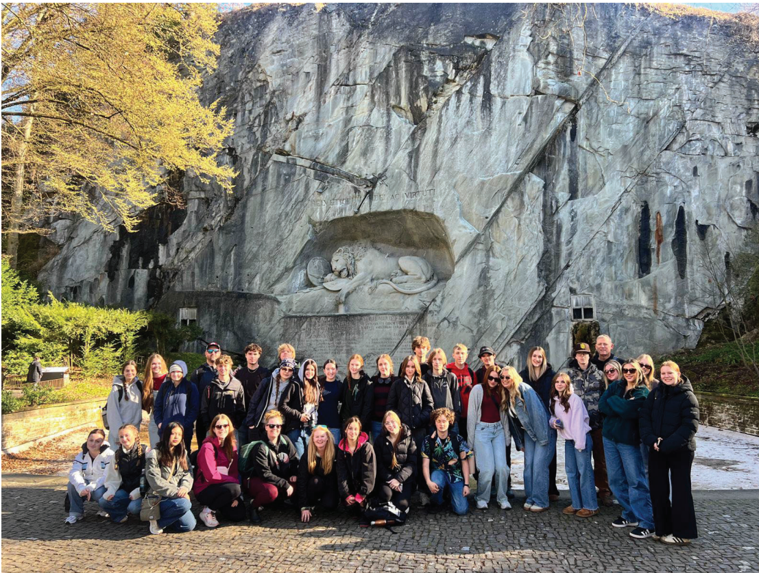
Europe Trip, 2026